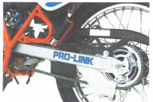
Pro-Link rear suspension with 170 mm axle travel.