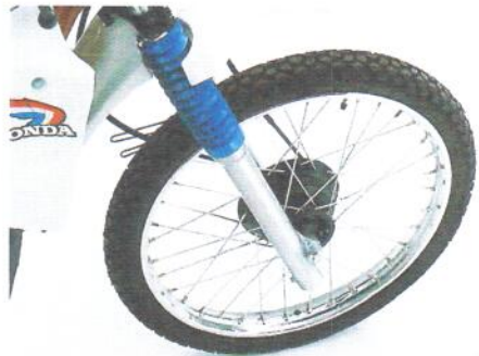
Hydraulic front forks with 200 mm travel.