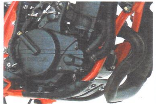
Liquid cooled 2-stroke single power unit.