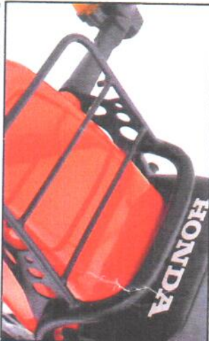
Standard, big-capacity carrier