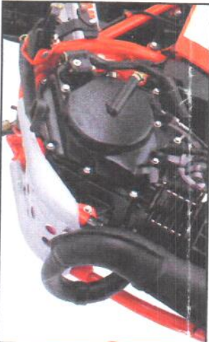
High-performance 2-stroke engine with robust sump guard