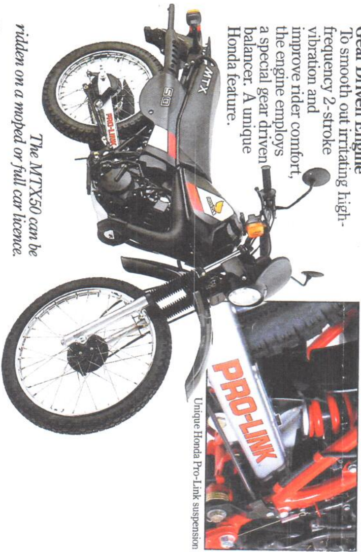
Unique Honda Pro-Link suspension

Another unique Honda system. By employing a linkage and one large, central hydraulic damper, damping force is softer during initial swingarm travel and increases progressively as the damper is compressed for outstanding bump control and exemplary handling.