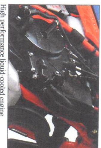
High performance liquid-cooled engine