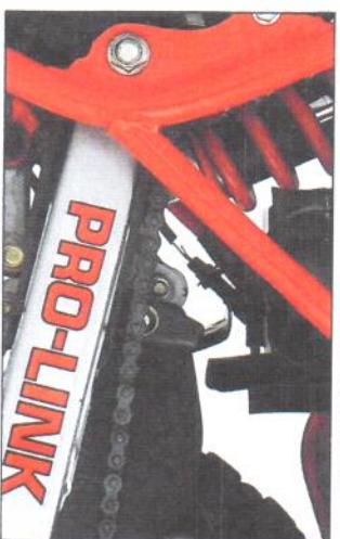
Competition Pro-Link rear suspension